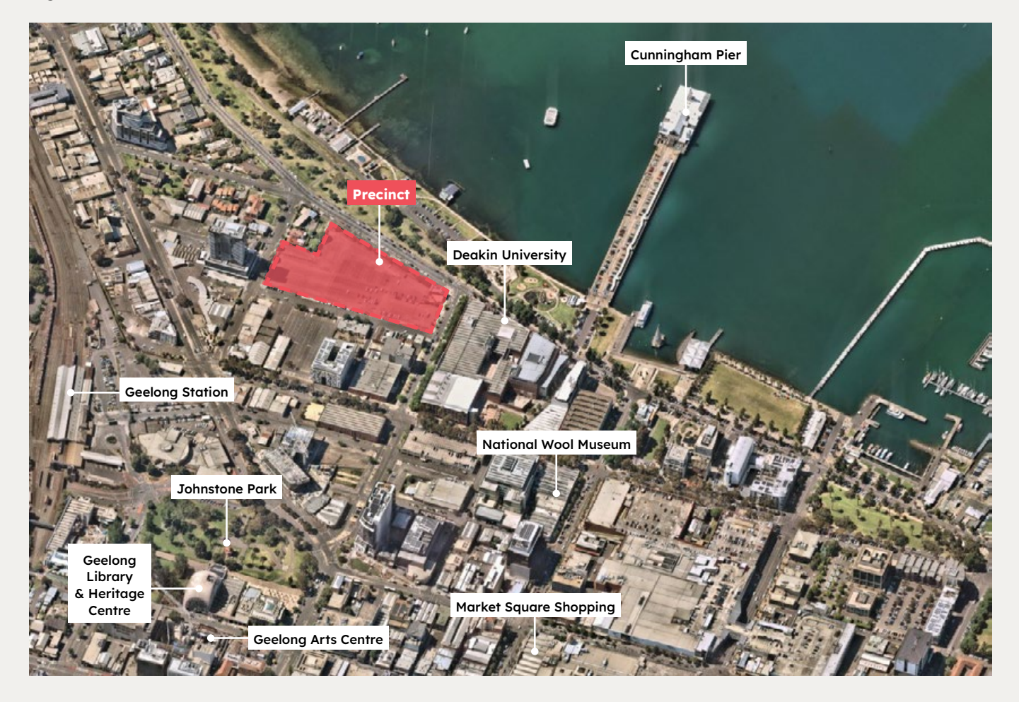
Figure 1: Aerial of Site and surrounds

The main elements of the precinct are shown in Figure 2, including the 1,000 seat plenary hall, exhibition halls, public plaza and back of house of Nyaal Banyul, the Hotel and future mixed use development.